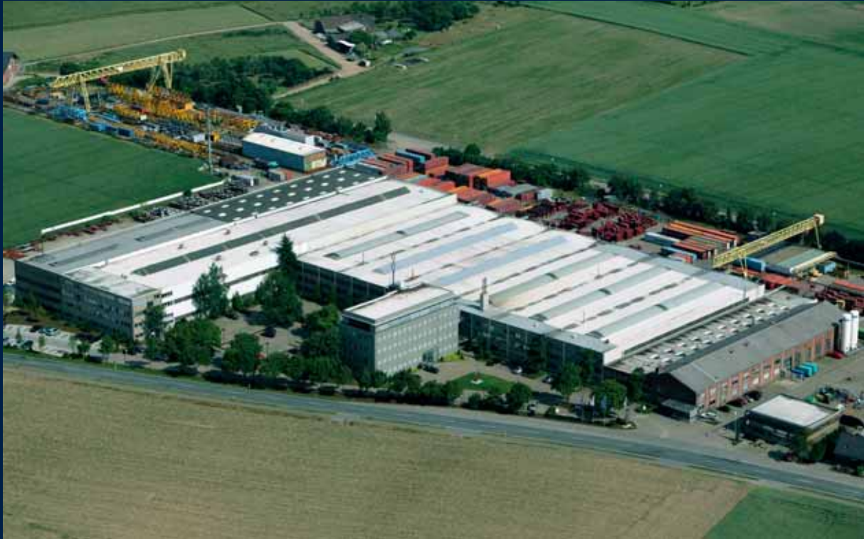
AUMUND Headquarters in Rheinberg, Germany